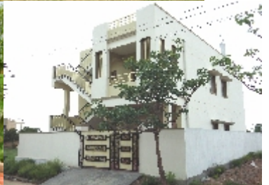
Our previous venture actual development