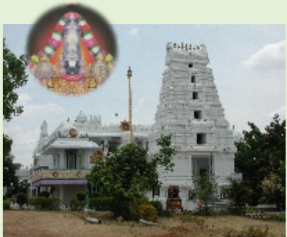
Venkateswara Swamy Temple