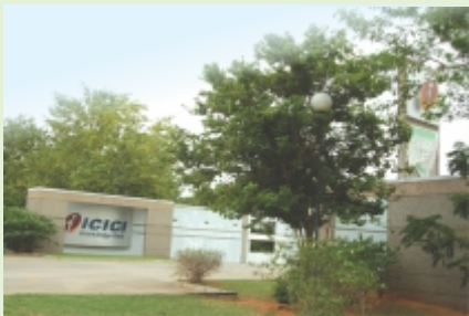
ICICI Knowledge Park