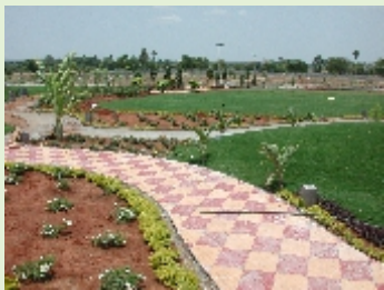
Pathway with land scaping