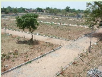
Internal black top roads