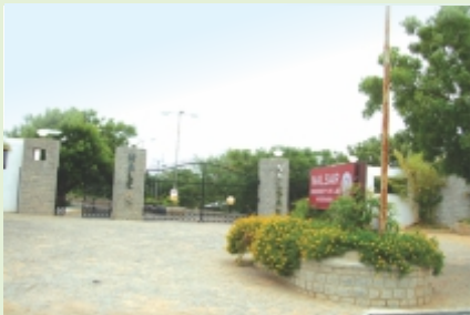
Nalsar Institute of Law