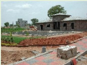
Swimming pool under construction