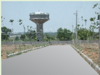
Overhead tank & Compound wall total layout