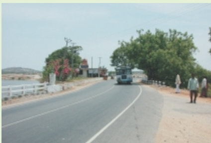
Rajiv Rahadari (Karimnagar Road)